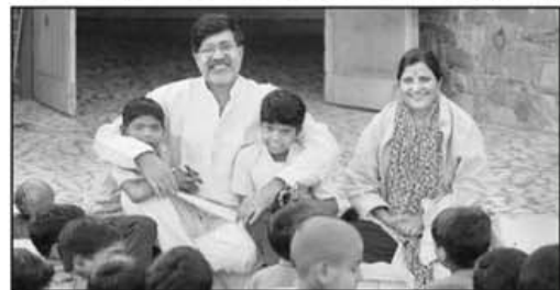
Continued on page 48

education, but I would like to emphasise over here that the legal and judicial mechanisms in the countries remain grossly under-utilised. It is appalling that laws related to slavery and trafficking are not enforced and implemented properly. The number of prosecutions and convictions in cases related to child labour, trafficking of children for forced labour and slavery are abysmally low. This clearly reflects the lack of political will to address these issues. We still have a soft approach on the perpetrators of crimes like worst forms of child labour. The law enforcement agencies in various countries are both understaffed and lack the capacity and knowledge to effectively deal with these crimes. This requires systematic and sustained efforts on the part of Governments. The civil society must also be equally proactive in bringing up such cases before the courts of law. The law enforcement machinery worldwide needs a compulsory overhaul in terms of capacity, robust accountability framework, fast track trial/ speedy justice delivery for the victims, composite and comprehensive rehabilitation of child labourers and their families into mainstream society. Inter-agency collaboration at all levels with integrated response entailing convergence of policy and programmatic interventions at grassroots level is a must have in the present times. Above all the Global Reporting