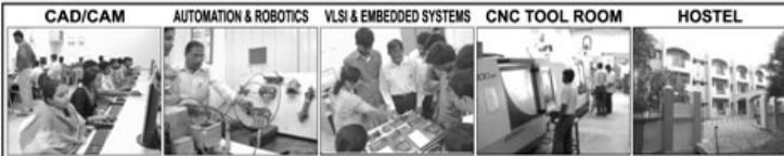
Sd/- PRINCIPAL DIRECTOR

Extension Centre Kolar: Shed No D - 31, 32, KSIDC, Industrial Estate, Kolar Gold Field, Karnataka. Mob: +91 9480274959.